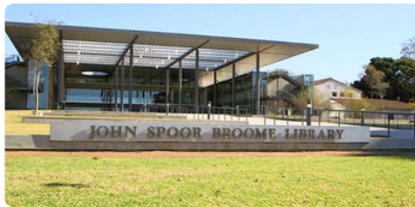
California State University Channel Islands (CSUCI) John Spoor Broome Library Room # 2325 One University Dr, Camarillo, CA 93012