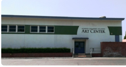
Studio Channel Islands Art Center (SCIART) Blackboard Gallery 2222 E. Ventura Blvd, Camarillo, CA 93010