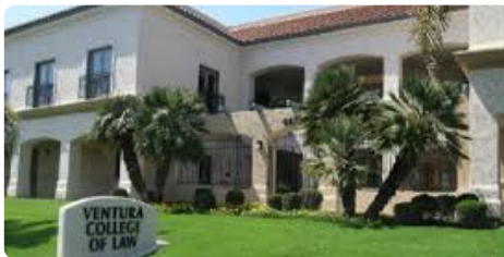
The College of Law - Ventura Campus (COLV) 4475 Market St, Ventura, CA 93003