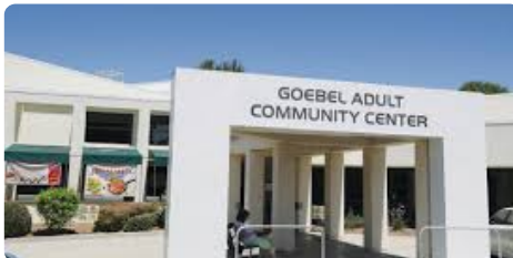
Goebel Adult Community Center (GACC) 1385 E Janss Rd, Thousand Oaks, CA 91362