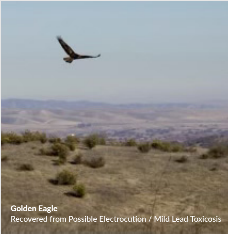
Golden Eagle Recovered from Possible Electrocutation / Mild Lead Toxicosis