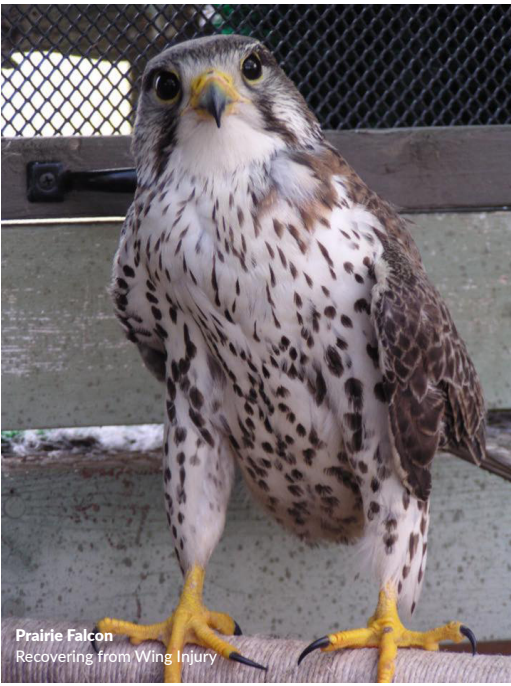
Prairie Falcon Recovering from Wing Injury