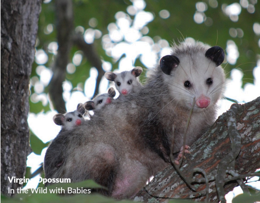
Virginia Opossum In the Wild with Babies

“A simple act of kindness and compassion towards a single animal may not mean anything to all creatures, but it will mean everything to one.”