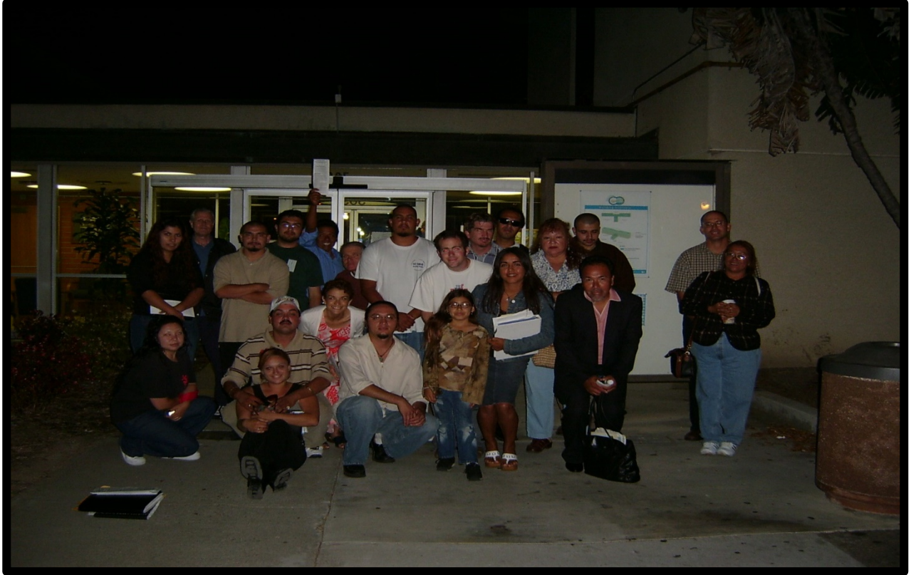
CORE, circa 2006